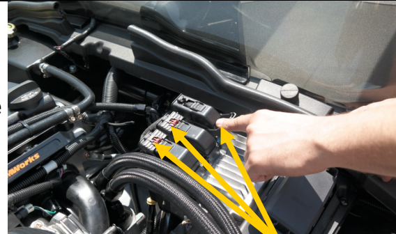
Raise all 3 locking levers to partially disengage