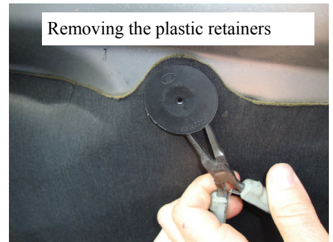
Removing the plastic retainers